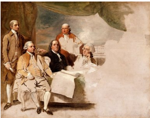
American Commissioners of the Preliminary Peace Agreement with Great Britain (unfinished) Painted by Benjamin West, 1783 or 1784 Winterthur Museum Wikimedia Commons