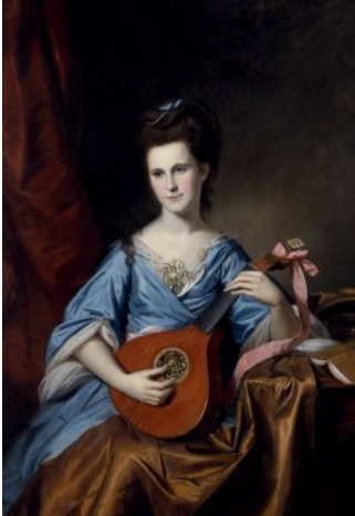
Portrait of Julia Stockton Rush Painted by Charles Willson Peale, 1776